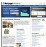
PR Web (press release)

The Truth About Mortgage Refinancing Revealed By Texas Mortgage Expert - SBWire (press release)